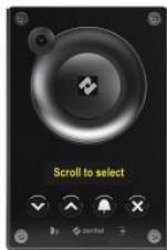
TCIV-6+ | Video Intercom IP and SIP Video Intercom