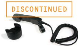
TAX-3 EX Handset