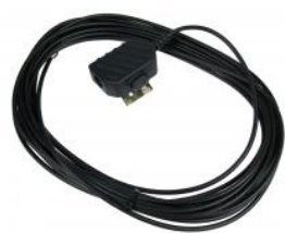
TAX-2B Ex-Approved Plugbox & Cable for Headset with PTT