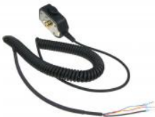
EMMAX-1H Handheld Industrial EX Microphone For Exigo/Turbine