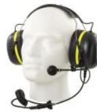
AK5850BHS Ex TwinCom Headband Headset w/ear plug connector

Ex-approved Headset with helmet mounting and connector for ear plug