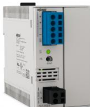
Power Supply 100-240VAC/48VDC 2A