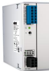
Power supply 100-240VAC/48VDC 5A