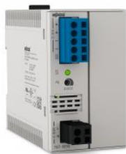
Power Supply 100-240VAC/24VDC 4A