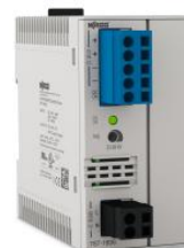
Power supply 100-240VAC/24VDC 2A