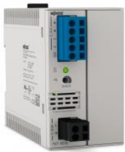
Power Supply 100-240VAC/24VDC 4A