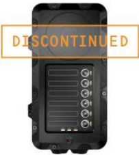
EAPFX-6 Exigo Industrial Ex Access Panel, 6 Buttons