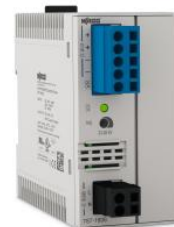
Power supply 100-240VAC/24VDC 2A