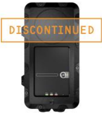
EAPFX-1 Exigo Industrial Ex Access Panel