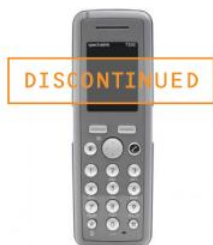
7212-FS DECT Handset

DECT repeater 4-ch, multi-cell wo/ power supply