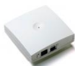
IP DECT Base Station