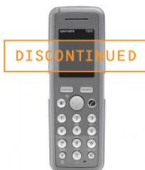
7622 DECT Handset

DECT Handset, IP54. Frequency-Swapping 1G8/1G9/SAM