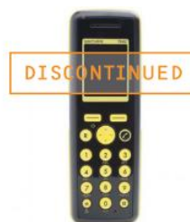
7642 DECT Handset