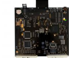
AMC-IP Version 11

Processor Board for AlphaCom XE and ESC1