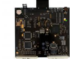
AMC-IP Version 11

Processor Board for AlphaCom XE and ESC1