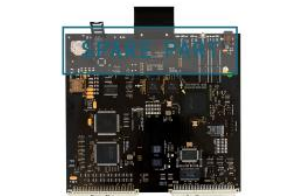
AMC-IP Version 11

Processor Board for AlphaCom XE and ESC1