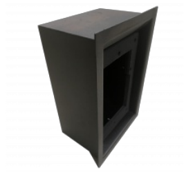
TA-18 Turbine Compact Flush-Mount Back Box