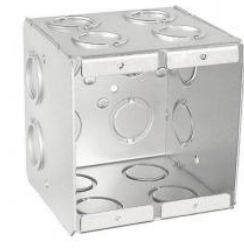
TA-2 US 2-Gang 3 1/2" Deep Backbox