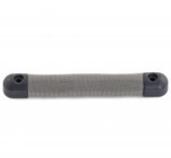
TA-14 Microphone windshield for TCIS / TCIV