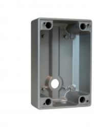
TA-1 Turbine Compact Onwall Back Box