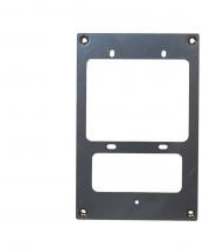
TA-5 Bracket for US 2 GANG Double Depth Back Box