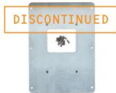
Turbine Adapter Plate