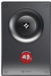
TCIS-2 | Audio Intercom