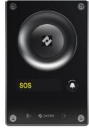
TCIS-4 | Audio Intercom