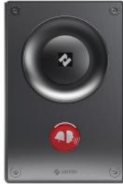
TCIS-2 | Audio Intercom