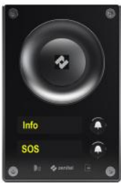
TCIS-5 | Audio Intercom