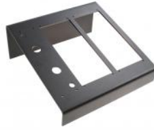
Triple Desk Stand