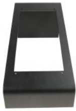
Single Desk Stand