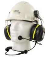
AK5850BS Ex TwinCom Helmet Headset w/ear plug connector

Ex-approved Headset with helmet mounting and connector for ear plug