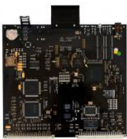
AMC-IP Version 11

Exigo System Controller Spare Power Supply