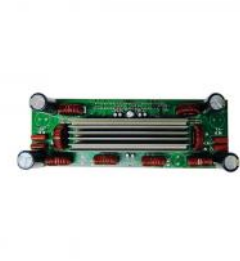
EAM-200 ENA2200 Amplifier Module