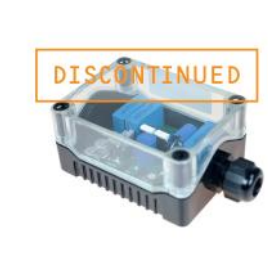
ELTSI-1 Exigo Industrial Line End Transponder