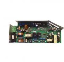
EPMA400 ENA2200 Amplifier Power Supply