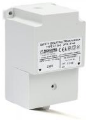
Mains Transformer 6A

Processor Board for AlphaCom XE and ESC1