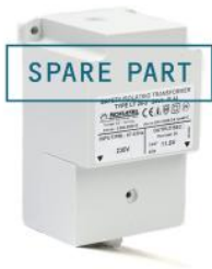
Mains Transformer 11A