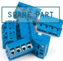
Connection Kit ASLT/AGA/ATLB