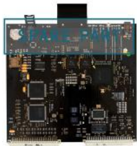
AMC-IP Version 11

Processor Board for AlphaCom XE and ESC1