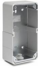
On Wall Back Box