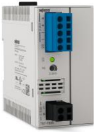
Power supply 100-240VAC/24VDC 2A

Switched-mode power supply, 1-phase, 24 VDC output voltage, 2A current