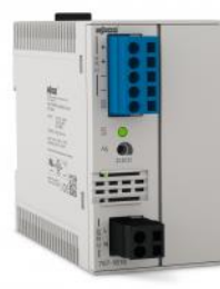
Power Supply 100-240VAC/24VDC 4A