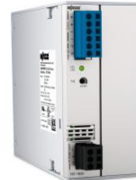
Power supply 100-240VAC/48VDC 5A

Switched-mode power supply, 1-phase, 48 VDC output voltage, 5A current