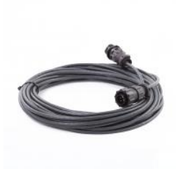
Extension Cable for headset and hand microphone, 10 m