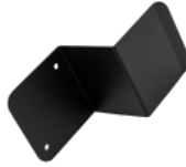
Headset Stowage Bracket

Spare Boom Microphone for all A-Kabel type Headsets