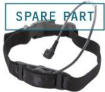
AK6070T Throat microphone for all A-kabel type Headsets

Headset stowage Bracket for Wall mounting