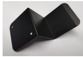
Headset Stowage Bracket

Spare Boom Microphone for all A-Kabel type Headsets