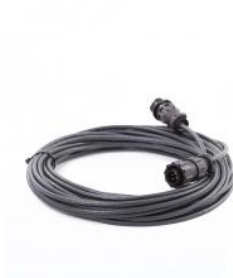
Extension Cable for headset and hand microphone, 10 m