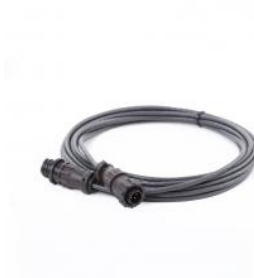
Extension Cable for headset and hand microphone, 5 m