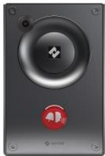
TCIV-2+ I Video intercom IP and SIP Video Intercom