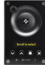
TCIV-6+ | Video Intercom