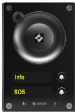
TCIV-5+ I Video intercom IP and SIP Video Intercom