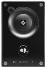
TCIV-3+ I Video intercom IP and SIP Video Intercom