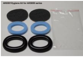
Hygiene kit for Headset