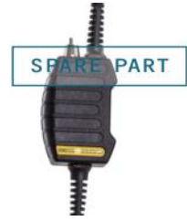
Spare Switchbox w/cable for VSP-36-PELP-A

Headset stowage Bracket for Wall mounting