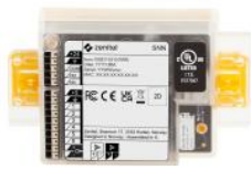
TKIS-2 Audio Intercom Kit