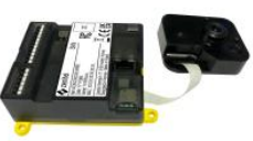
TKIV+ Video Intercom kit