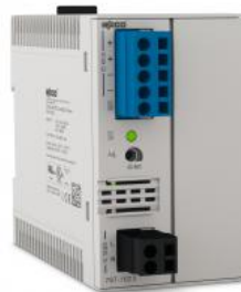
Power Supply 100-240VAC/48VDC 2A