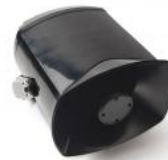
DSP-15 EExmN, 25W

Ex horn speaker for TFIX-V2 stations, 8 Ohm