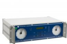
Marine Master Clock 70000