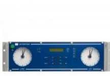
Marine Master Clock with Network Time Server, 70000L

123378-11 Marine Master Clock 70000L With Network Time Server