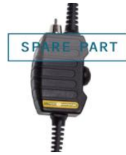
Spare Switchbox w/cable for VMP-36-PEL-Ad

Headset stowage Bracket for Wall mounting