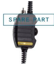
Spare Switchbox w/cable for VMP-36-PEL-Ad

Headset stowage Bracket for Wall mounting