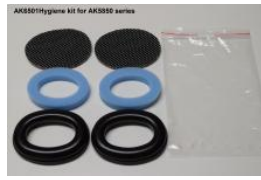
Hygiene kit for Headset

Spare Boom Microphone for all A-Kabel type Headsets