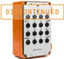
Industrial Master Station