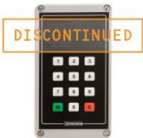
Light Industrial Master Station