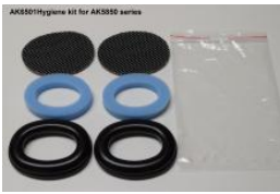
Hygiene kit for Headset

Spare Boom Microphone for all A-Kabel type Headsets