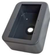
TA-38 | VR3G On-Wall Backbox