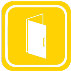
iVENCs SCADA Control Module