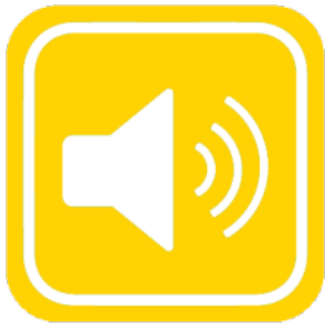
iVENCs Public Address Module