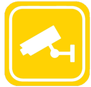
iVENCs CCTV Module