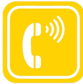
iVENCs Help Points Module