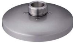
SBP-300HM6S Hanging Mount Stainless Steel Adapter for XNV