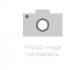
Mounting plate for Exigo Access Panels - 2 Mounting plate for 2 pcs. Exigo Access Panel, 19" 4HU