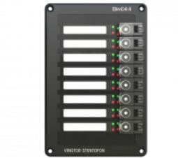
EBMDR-8 Exigo Button Expansion Module, 8 Buttons