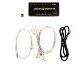
EPIPR-6 Exigo Power Injector, Spare Pair PoE, 6 Ports