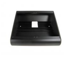
EMBR-2 Mounting Box for ECPIR, EAPIR and EBMDR-8 Panels