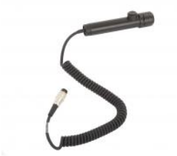
PAM1H Handheld Microphone for ECPIR Indoor Access Panels / Intercom Stations