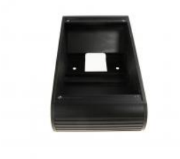
EMBR-1 Mounting Box for ECPIR, EAPIR and EBMDR-8 Panels