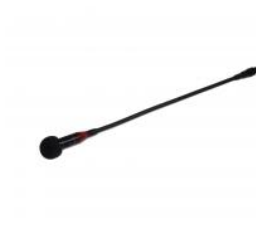
MB-30G Gooseneck Microphone