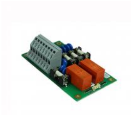
TA-10 Relay Module