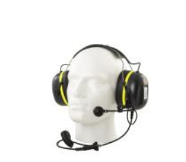
AK5850BHS Ex TwinCom Headband Headset w/ear plug connector Ex-approved Headset with headband