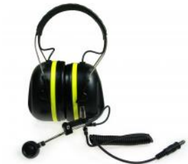
AK5850HS Ex-approved Headset