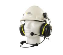
AK5850BS Ex TwinCom Helmet Headset w/ear plug connector Ex-approved Headset with helmet mounting and connector for ear plug