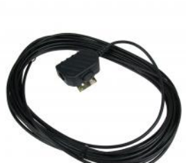
TA-22B Industrial Plugbox & Cable for Headset with PTT