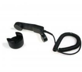
TA-23 Industrial Handset for Turbine with PTT