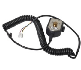
EMMAI-2H Handheld Compact Industrial Microphone For Exigo/Turbine