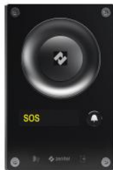
TCIS-4 | Audio Intercom