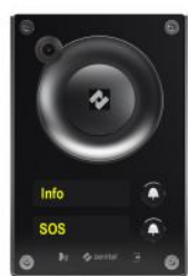
TCIV-5+ | Video intercom