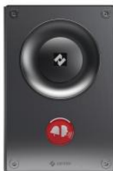
TCIS-2 | Audio Intercom