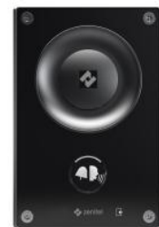
TCIS-3 | Audio Intercom