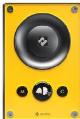
TCIS-1 | Audio Intercom

Bracket for US 2 GANG Double Depth Back Box