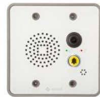
TMIV-1+ | Mini Video Intercom