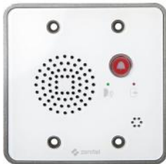
TMIS-1 | Mini Audio Intercom