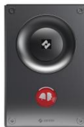
TCIS-2 | Audio Intercom