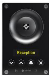
TCIS-6 | Audio Intercom