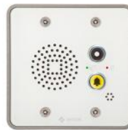
TMIS-4 | Mini Audio Intercom