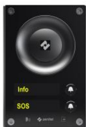
TCIS-5 | Audio Intercom