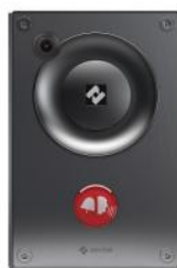
TCIV-2+ | Video intercom