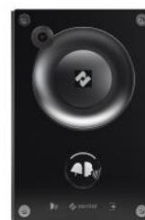
TCIV-3+ | Video intercom