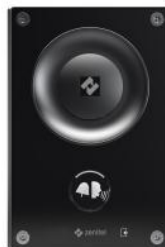
TCIS-3 | Audio Intercom