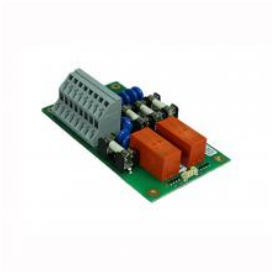
TA-10 Relay Module