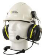
AK5850BS Ex TwinCom Helmet Headset w/ear plug connector Ex-approved Headset with helmet mounting and connector for ear plug