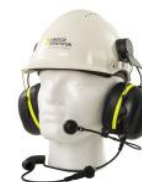
AK5850BS Ex TwinCom Helmet Headset w/ear plug connector

Ex-approved Headset with helmet mounting and connector for ear plug