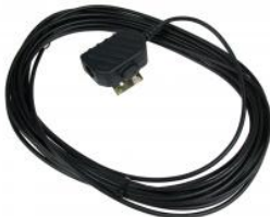
TA-22B Industrial Plugbox & Cable for Headset with PTT