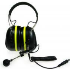
AK5850HS Ex-approved Headset