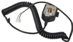
EMMAI-2H Handheld Compact Industrial Microphone For Exigo/Turbine