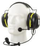
AK5850BHS Ex TwinCom Headband Headset w/ear plug connector Ex-approved Headset with headband